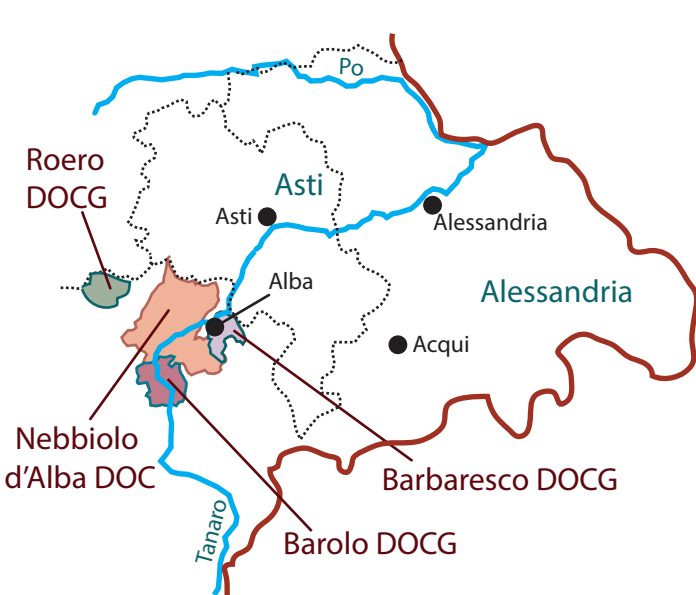
Regions featuring Nebbiolo