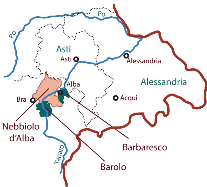
Regions featuring Nebbiolo