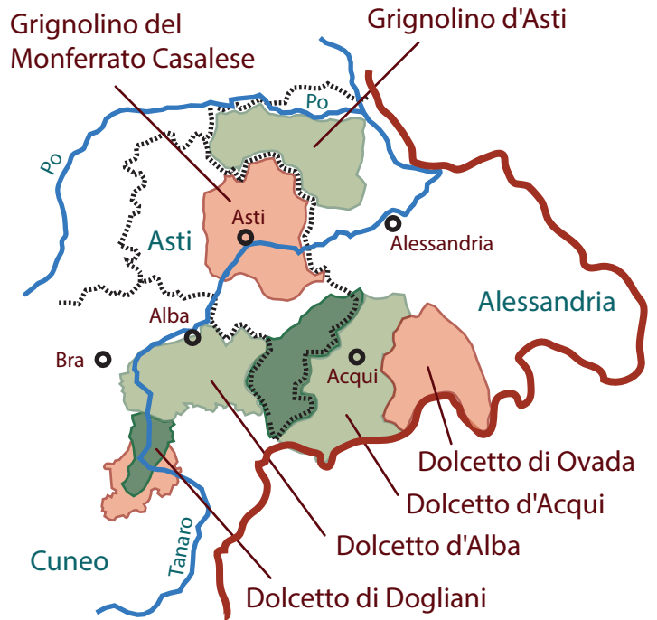
Regions featuring Dolcetto and Grignolino