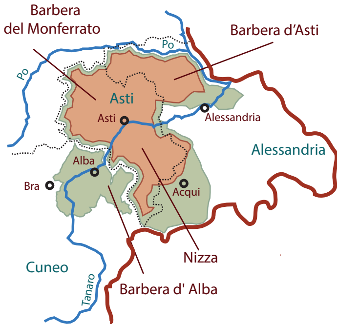
Regions featuring Barbera