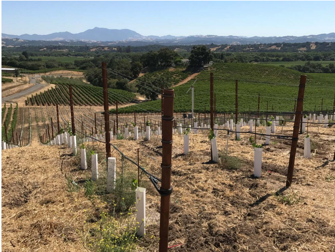
Complete replanting of Little Hill Vineyard because of Pierce's disease.