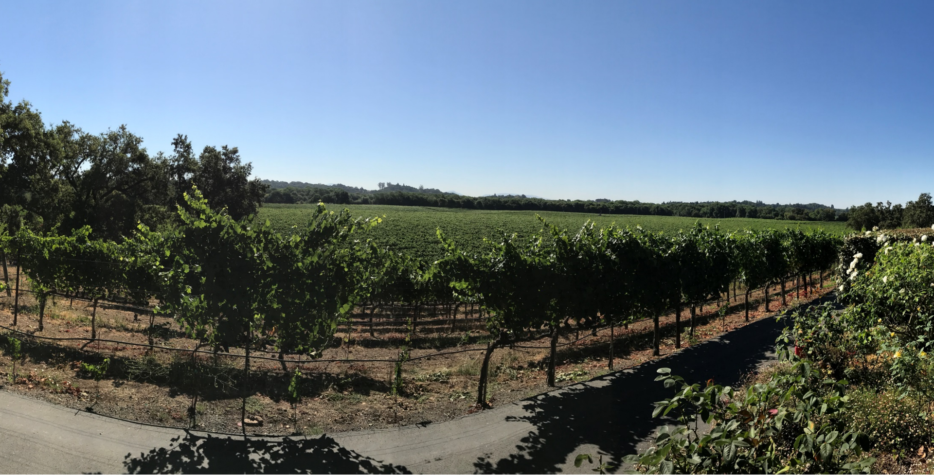
Original Rochioli Vineyard from Tasting Area. July 2017.