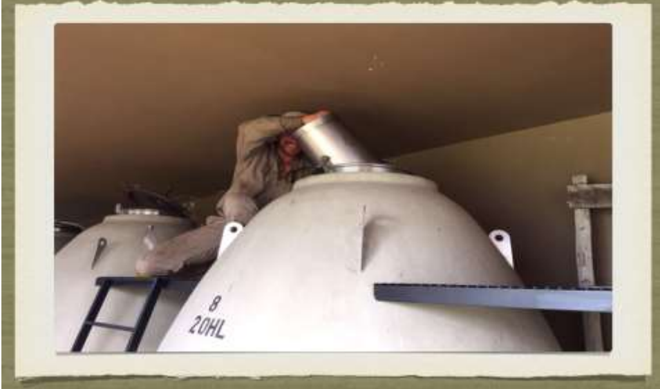
Egg shape vats for fermentation and ageing