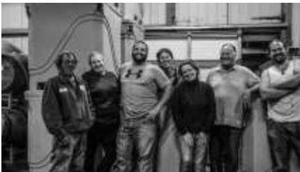
Bates and Company