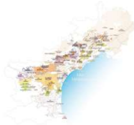
Languedoc – #1 for Syrah