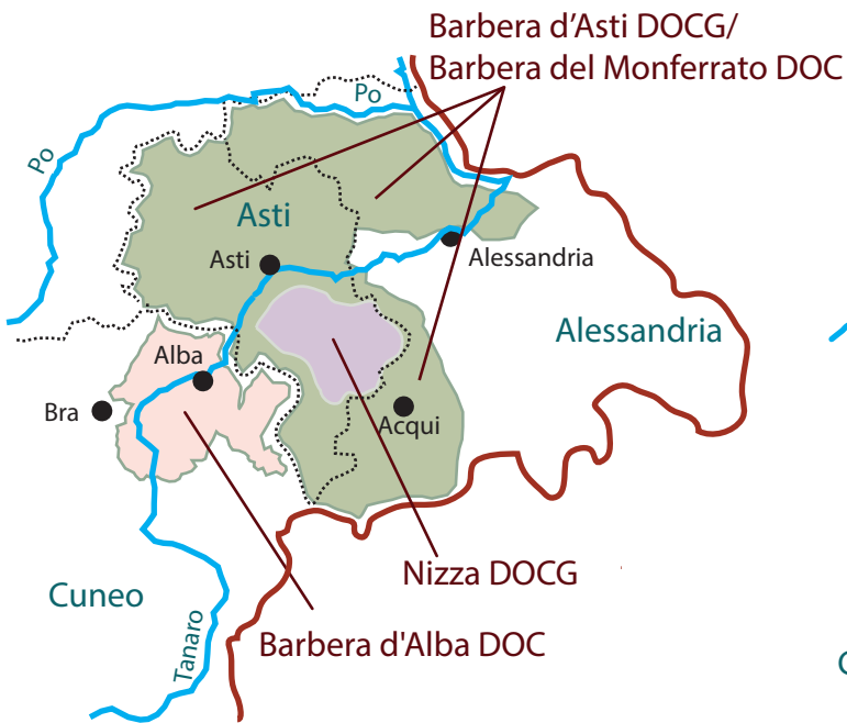
Regions featuring Barbera