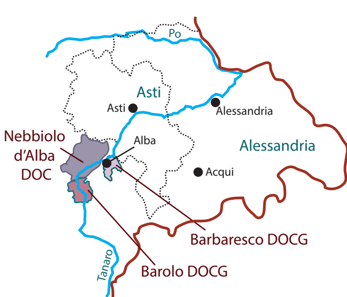
Regions featuring Nebbiolo